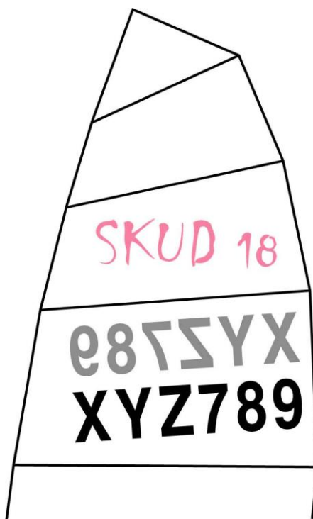
SKUD 18 Insignia - Hot Pink Pantone 812U Insignia reads correctly from Port side

Sail Numbers & Letters - Black Numbers & Letters read correctly from both sides