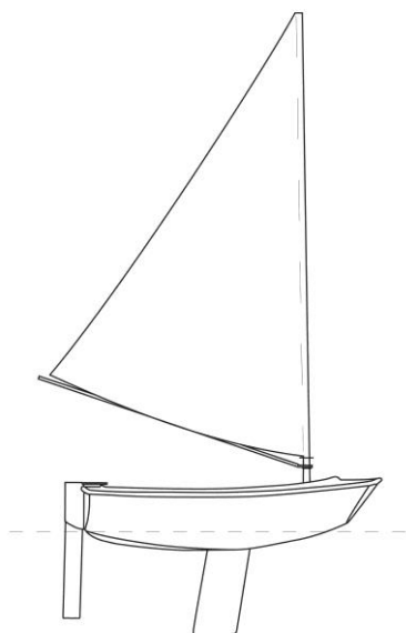
Hansa 2.3 2.3m Cat Rigged Single Person or Two Person Single Rudder Blade