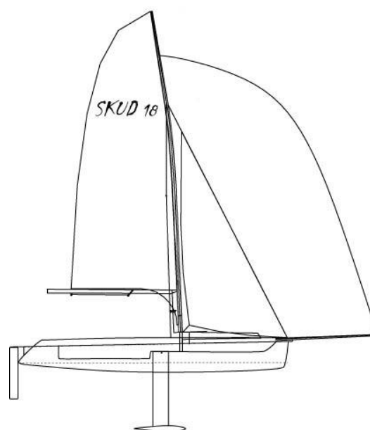
SKUD 18 5.8m Sloop Rigged Two Person Self Tacking Jib Asymmetric Gennaker Twin Rudder Blades