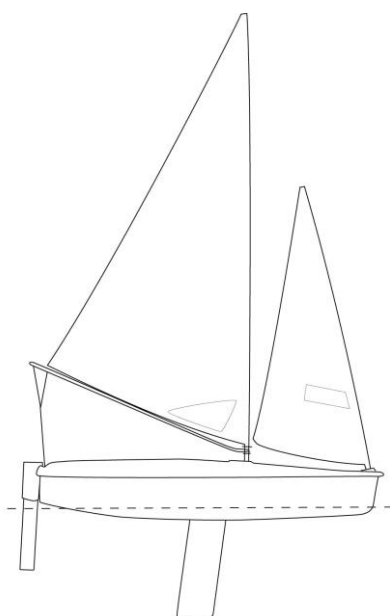
Liberty 3.6m Schooner Rigged Single Person Self Tacking Jib with Strut Twin Rudder Blades